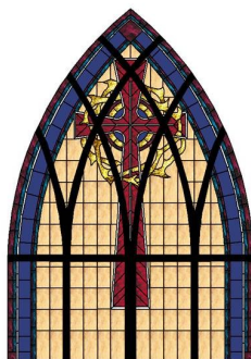
Christ Presbyterian Church